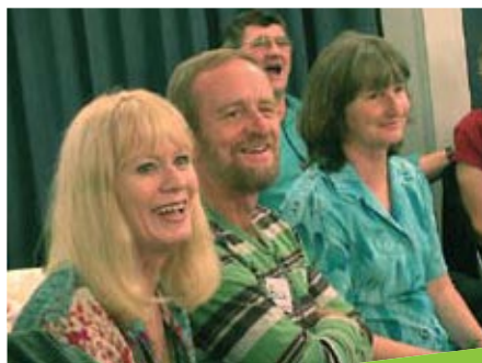
OUR FIRST CHOIR SOCIAL EVENT

When interviewed about the perceived benefits of singing, choristers will often site an improvement in respiratory function as an example. Formal testing would suggest this is not the case although with training there is an improvement in breath control.